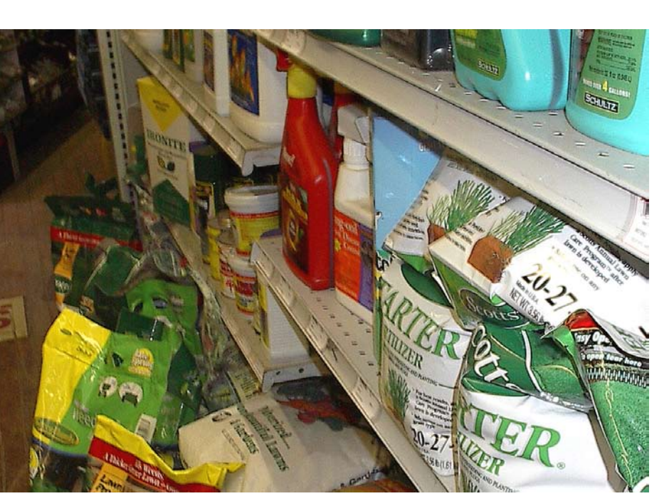
"linert" ingredients can make up as much as 99% of many common pesticide products.

Least-toxic alternatives to dangerous fumigant pesticides are already in use to control nematodes, plant diseases and weeds, and include: use of pest-resistant plant varieties, crop rotation, use of cover crops, use of green manures or mustard seed meal, soil solarization, use of predatory nematodes, and use of microbial pesticides. The United Nations Environment Program (UNEP) has extensive documentation of the available non-chemical and chemical alternatives to fumigants. (See http://www.panna.org/fumigants/alternatives for links to the UNEP documents and more detail on available alternatives.)