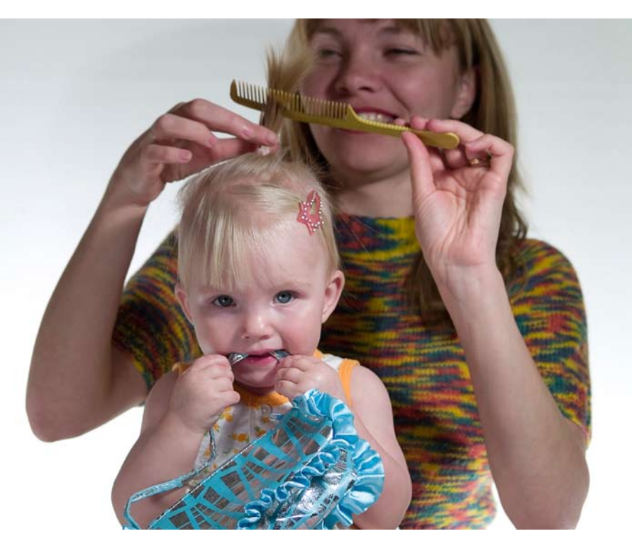
Despite lindane's known dangers, FDA continues to approve its use as an ingredient in shampoos and lotions to control lice and scabies.

through the cleanup of algae and trash from rivers and streams; and education has improved hygienic conditions in the home. The success is a result of cooperative efforts under the North America Regional Action Plan from the Commission for Environmental Cooperation (CEC).