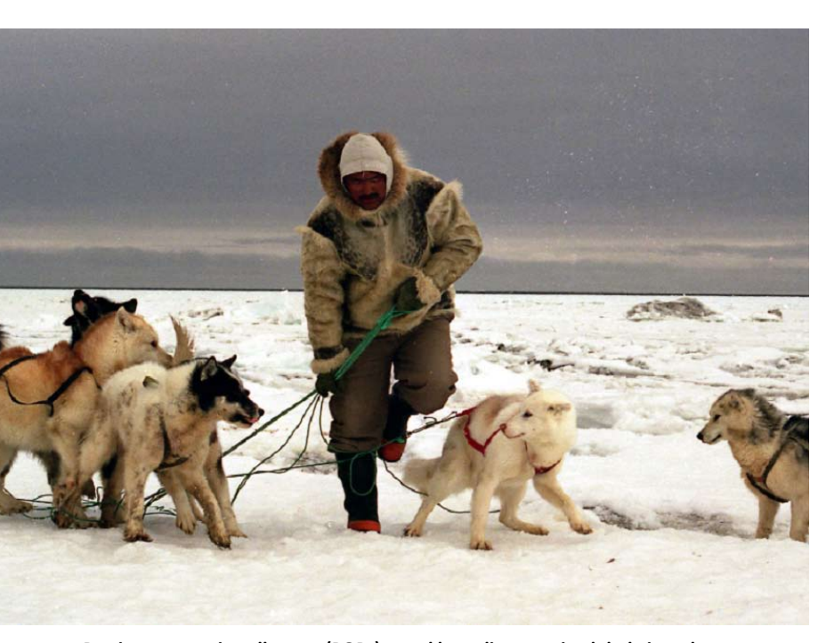
Persistent organic pollutants (POPs) travel long distances in global air and water currents, and concentrate in the Arctic.

Malaria kills one million people a year, with over 80 percent of the deaths occurring among children in sub-Saharan Africa. We fully recognize the importance of targets set by African heads of State in April 2000 to halve mortality for Africa's people by 2010. We applaud U.S. government and international efforts to mobilize the political will and resources to tackle malaria worldwide,