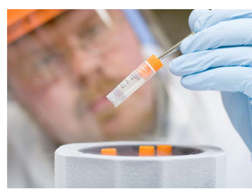
The federal government has changed its position on human testing of pesticides for registration purposes several times since the 1990's.

EPA's risk assessment process that determines label requirements under FIFRA operates in a national context using probabilistic modeling that averages risk factors and assumes full label compliance that does not include non-target impacts that occur from pesticidal drift, run-off and other unintentional exposure. The CWA NPDES permits work in tandem with FIFRA to consider local environmental conditions and the specific impacts of pesticide application to local water bodies. As the 9th Circuit District court has also determined, the warnings on the label simply do not and cannot address specific water quality issues, such as accumulations of toxic chemicals specific to a certain site, concerns for the local habitat or sensitive population species that may be monitored locally. NPDES permits under the CWA on the other hand are highly local and specific and include monitoring and reporting requirements that can track which pesticide applications