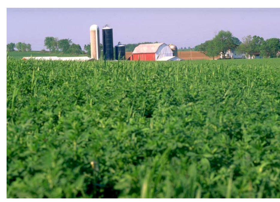
Given that viable organic methods exist as an alternative, it is unneccessary to register hazardous pesticides.

During the Bush Administration, EPA registered a new highly toxic fumigant pesticide for use in agriculture, methyl iodide. In 2007, EPA registered the new carcinogenic fumigant pesticide, methyl iodide (also called iodomethane), for one year; in October 2008, EPA granted a permanent registration to the pesticide. EPA registered this chemical despite serious concerns from environmentalists, farmworkers, rural residents and a group of over 50 eminent scientists, including two Nobel Laureates. These