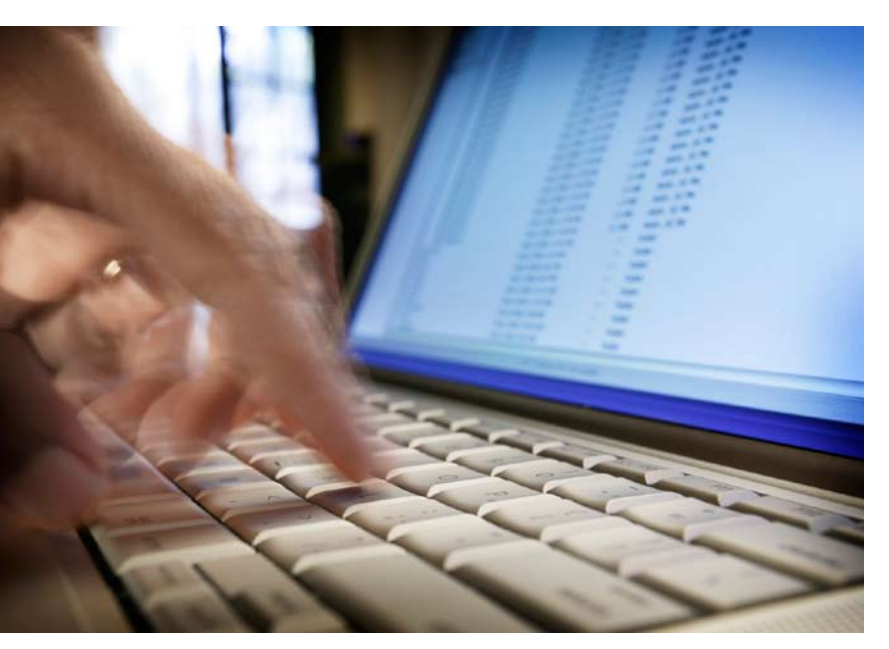
Groups are asking that the federal government release scientific data.

should not exempt those toxic pesticides in food packaging from review under section 408 of FFDCA, particularly in the case of food packaging for which there are no pesticidal claims even though it may contain pesticides. For food consumers, the question is whether the use of a substance known to have hazardous characteristics, regardless of a pesticidal claim, is being used and whether its use creates harmful residues.