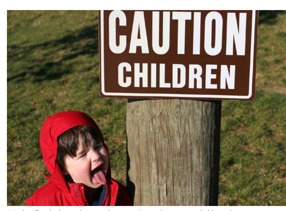
EPA classifies the heavy duty wood preservatives as known or probable carcinogens.

(See http://www.beyondpesticides.org/wood/index.htm for background information and regulatory comments submitted in June 2008 on behalf of 50 organizations.)