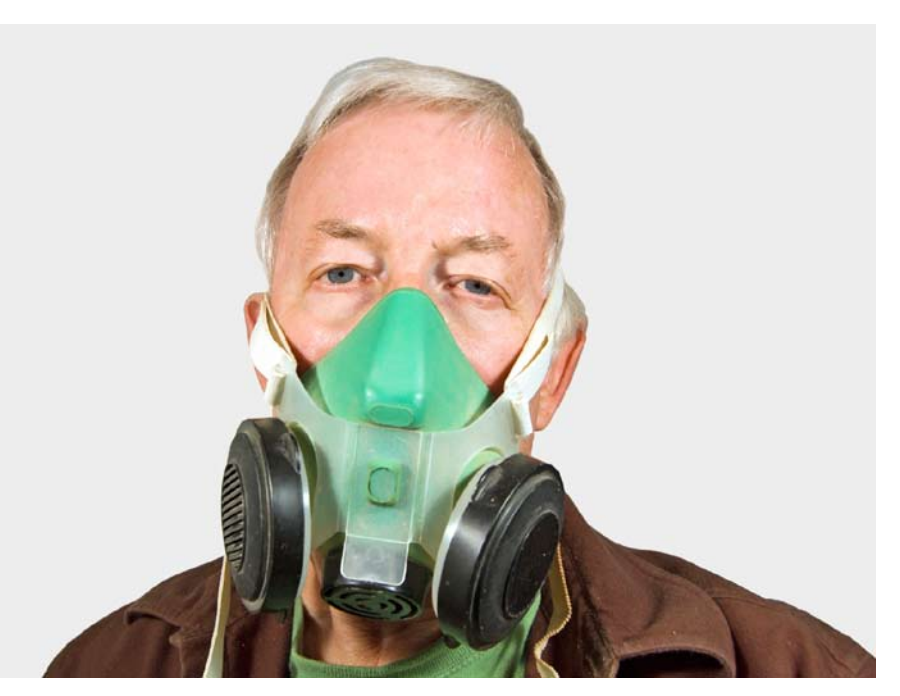
Chemical sensitivity manifests itself as a range of incapacitating neurological and respiratory symptoms.

experiments for EPA regulatory purposes would be ethical and scientifically valid.