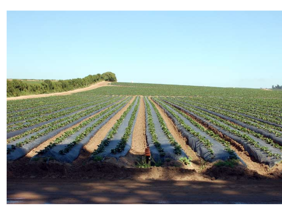
Scientists are working on alternatives to methyl bromide, which has been used for years as a soil fumigant, particularly in strawberry fields.