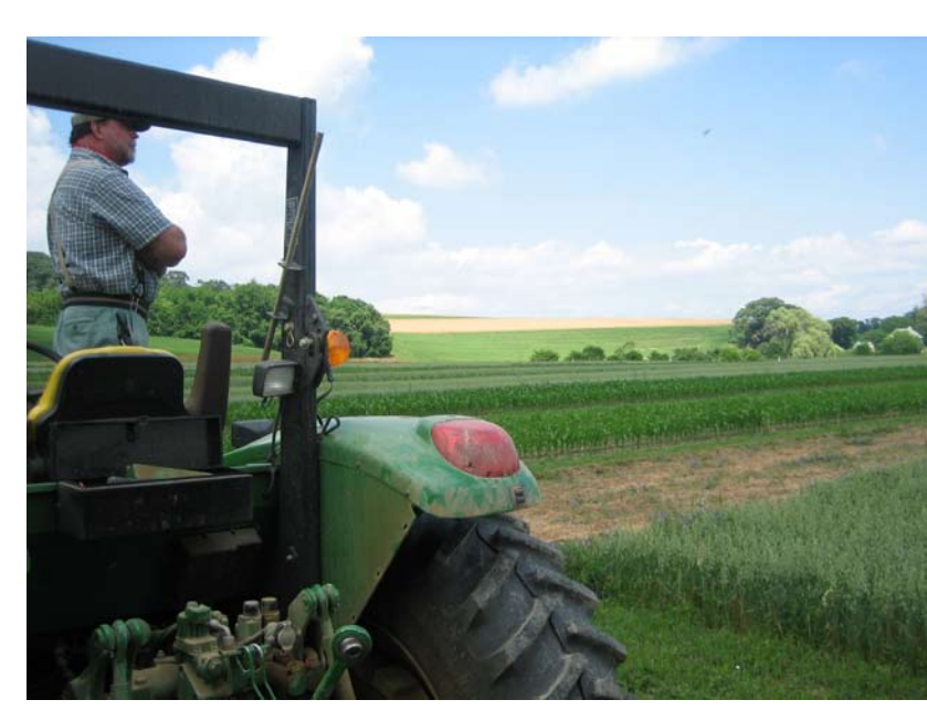
Data from Rodale's Farming Systems Trial (pictured here) shows that organic farming is one of the most powerful tools in fighting global climate change.

Around the world, hundreds of scientists and more than 55 governments agree that organic, regenerative agricultural solutions are needed to address our pressing problems of hunger, poverty and economic development. The International Assessment of Agricultural Knowledge, Science, and Technology for Development (IAASTD), an intergovernmental assessment cosponsored by the Food and Agriculture Organization, UN Development Programme, Global Environment Facility, UN Environment Programme, UNESCO, the World Bank, and the World Health Organization, with over 400 contributing scientists from around the world, provides a thorough analysis of successes and failures of the world's food and agricultural systems, and a comprehensive list of policy, institutional and investment options to reorient towards equitable and sustainable food systems that will meet development goals agreed upon by all nations. Yet the United States was one of only three participating countries that did not formally approve the report at the final intergovernmental plenary in April 2008. We encourage your administration to study the IAASTD report and ask you to join the international community in making commitments to implement its options for achieving equitable and sustainable development.