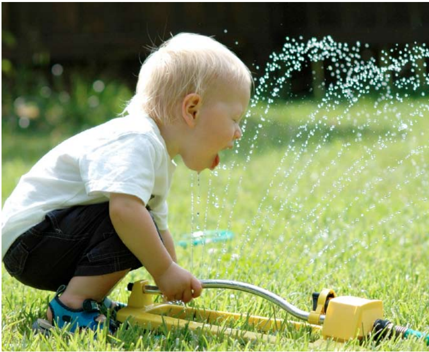
Much of our drinking water supply is contaminated with one or more pesticides.

EPA's Pesticide Environmental Stewardship Program (PESP), "a voluntary program that forms partnerships with pesticide users," should transition from a "risk reduction" to a "use reduction and elimination" program. This modernized approach is feasible under the "unreasonable adverse effects" standard of FIFRA, given the availability of new technologies and methods that render the risk reduction approach antiquated, ineffective and, therefore,