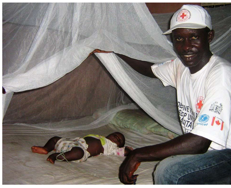
A Red Cross worker in Sierra Leone shows a mosquito bed net.